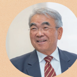
KANADE Takeo U.A. and Helen Whitaker Professor, Robotics Institute, Carnegie Mellon University