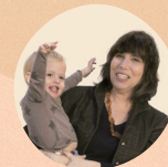
Alison GOPNIK Distinguished Professor, Department of Psychology, University of California, Berkeley